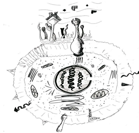
A Tibetan mandala?